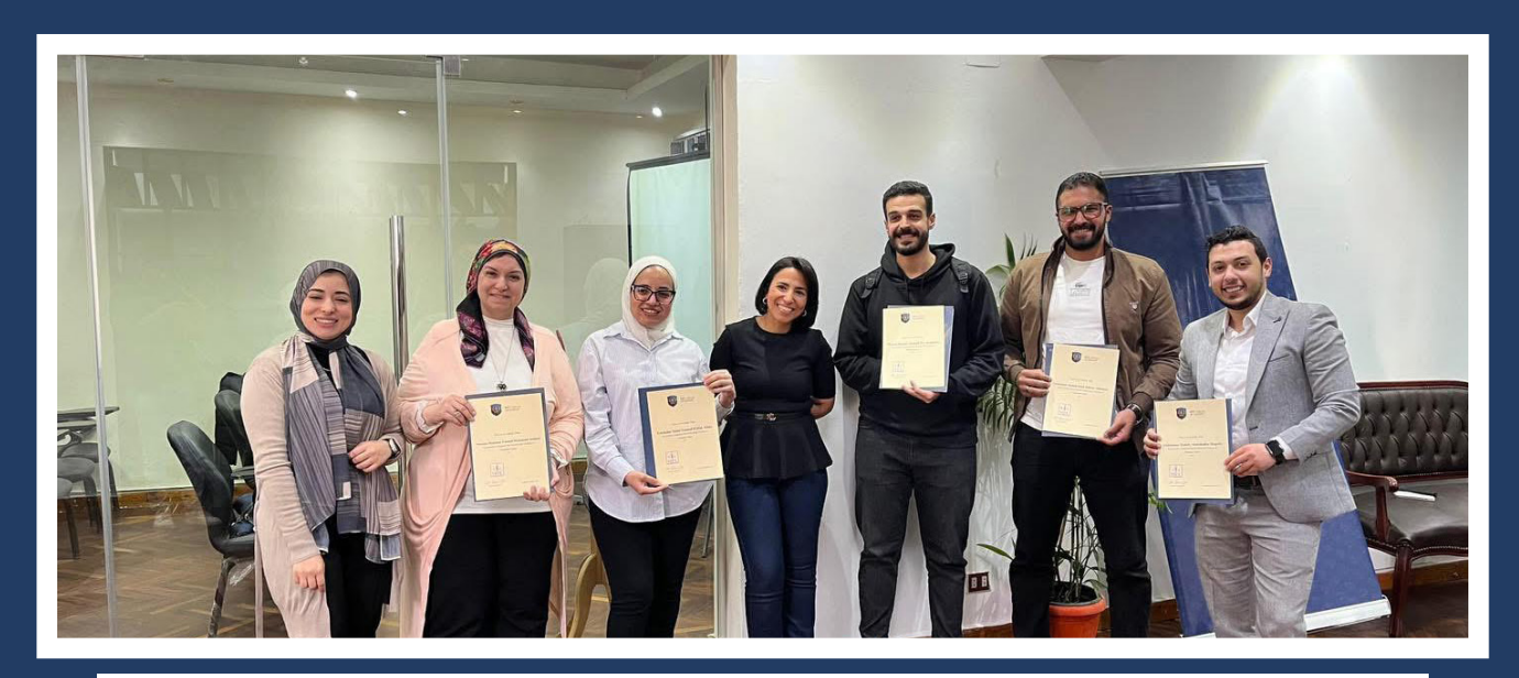
Factoring Course for International Company For Leasing S.A.E "Incolease" and Catalyst