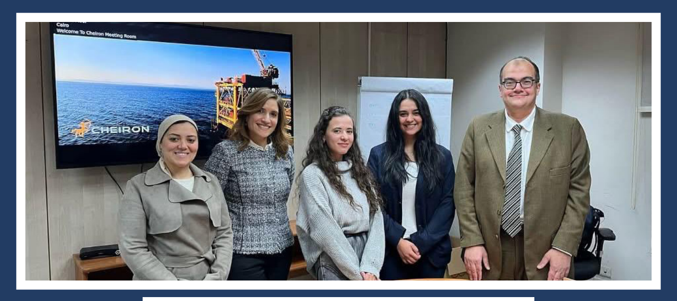
Compliance Course for Cherion Petroleum Corporation